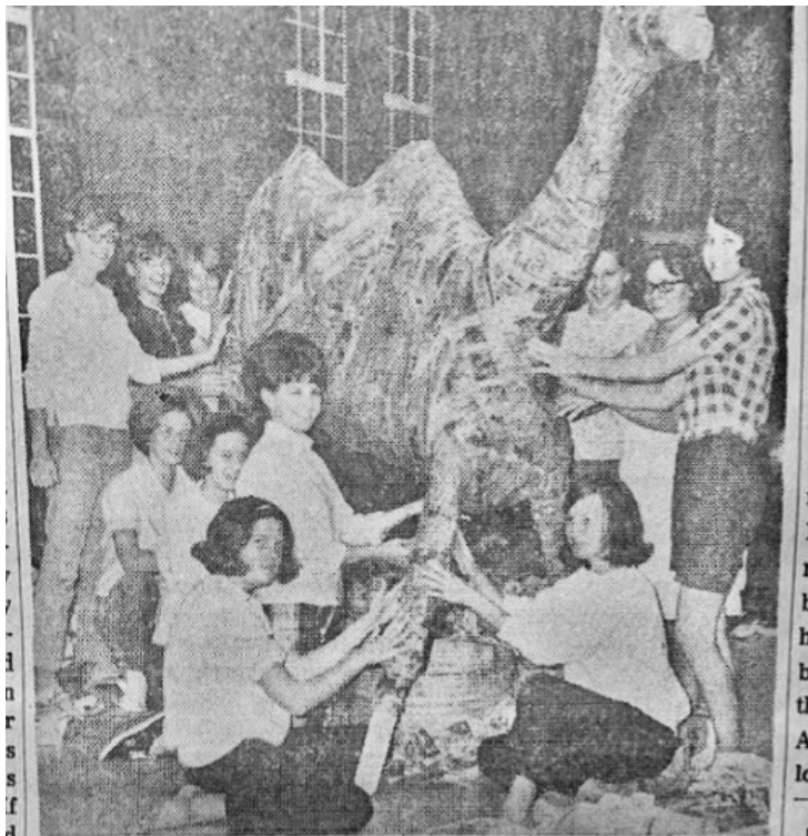
Camels for Bay City

"If we only had a camel," has been the wishful cry of the young people who present a live Christmas tableau at First Church Bay City each year. This year the Senior High Fellowship decided to take the matter—using papier-mache medium—into their own hands. Shown fattening one of three camels prepared for this year's tableau are Bay City Senior Highs. They presented the tableau in three scenes: the shepherds with the Angel, the manger with Mary, Joseph, and the Babe, and wise men and camels in the distance.